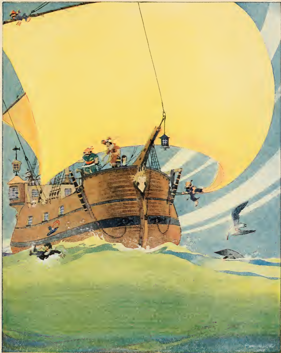
Splash! and the Master Mariner fell into the sea.